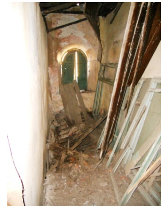
Condition of house in 1991