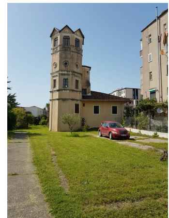
Property today after many hours of dedication and labor.